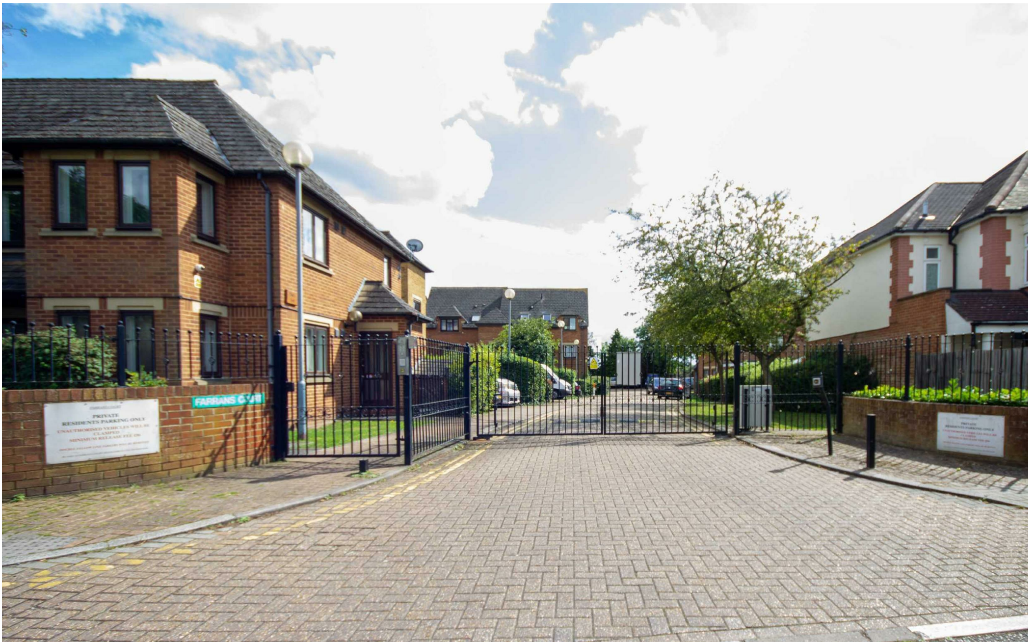
21 Farrans court Northwick Avenue, HARROW, Middlesex, HA3 0AT £1,450 Per Month