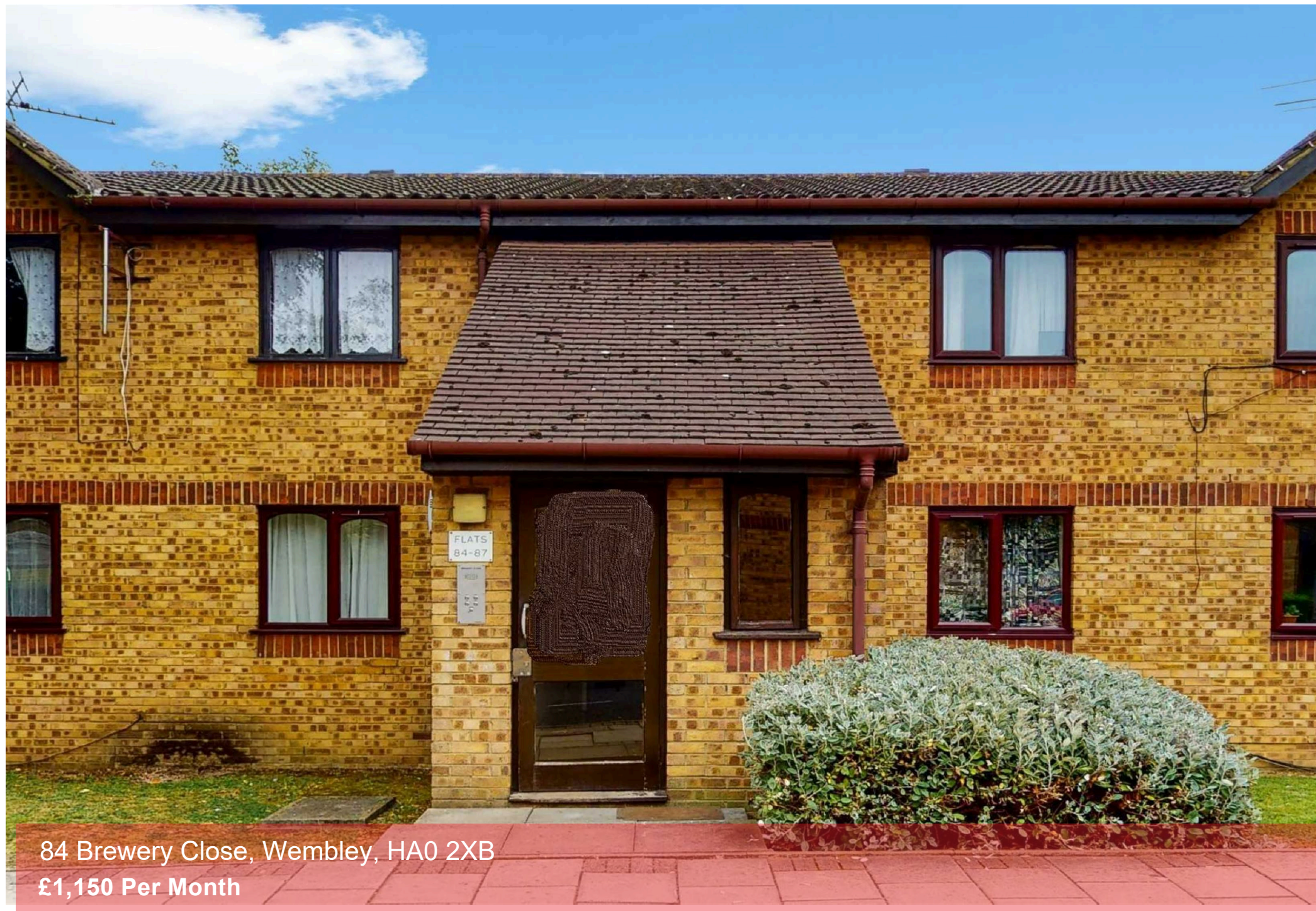
84 Brewery Close, Wembley, HA0 2XB £1,150 Per Month