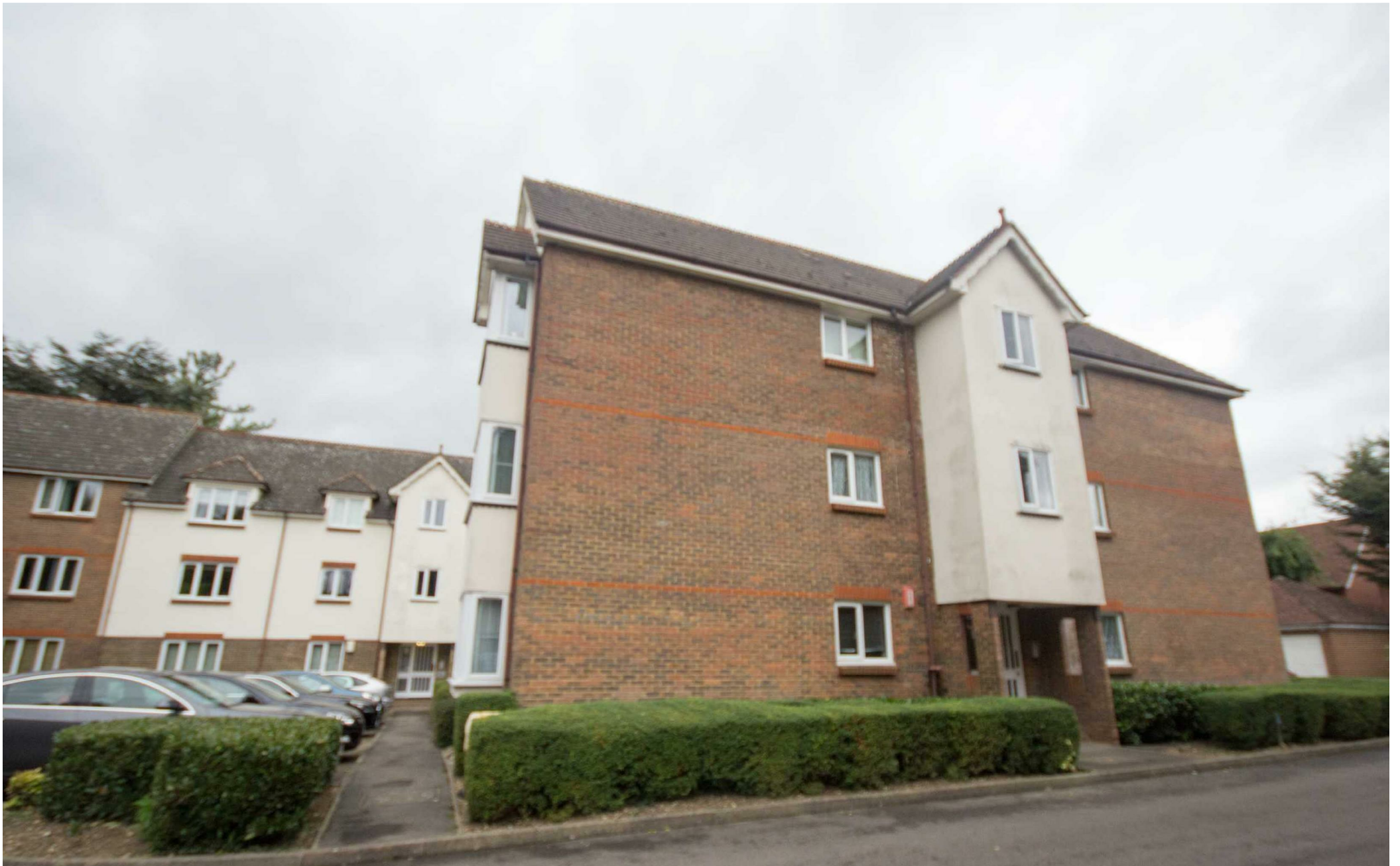
68 Granville Place, Elm Park Road, Pinner, Middlesex, HA5 3NL £1,350 Per Month