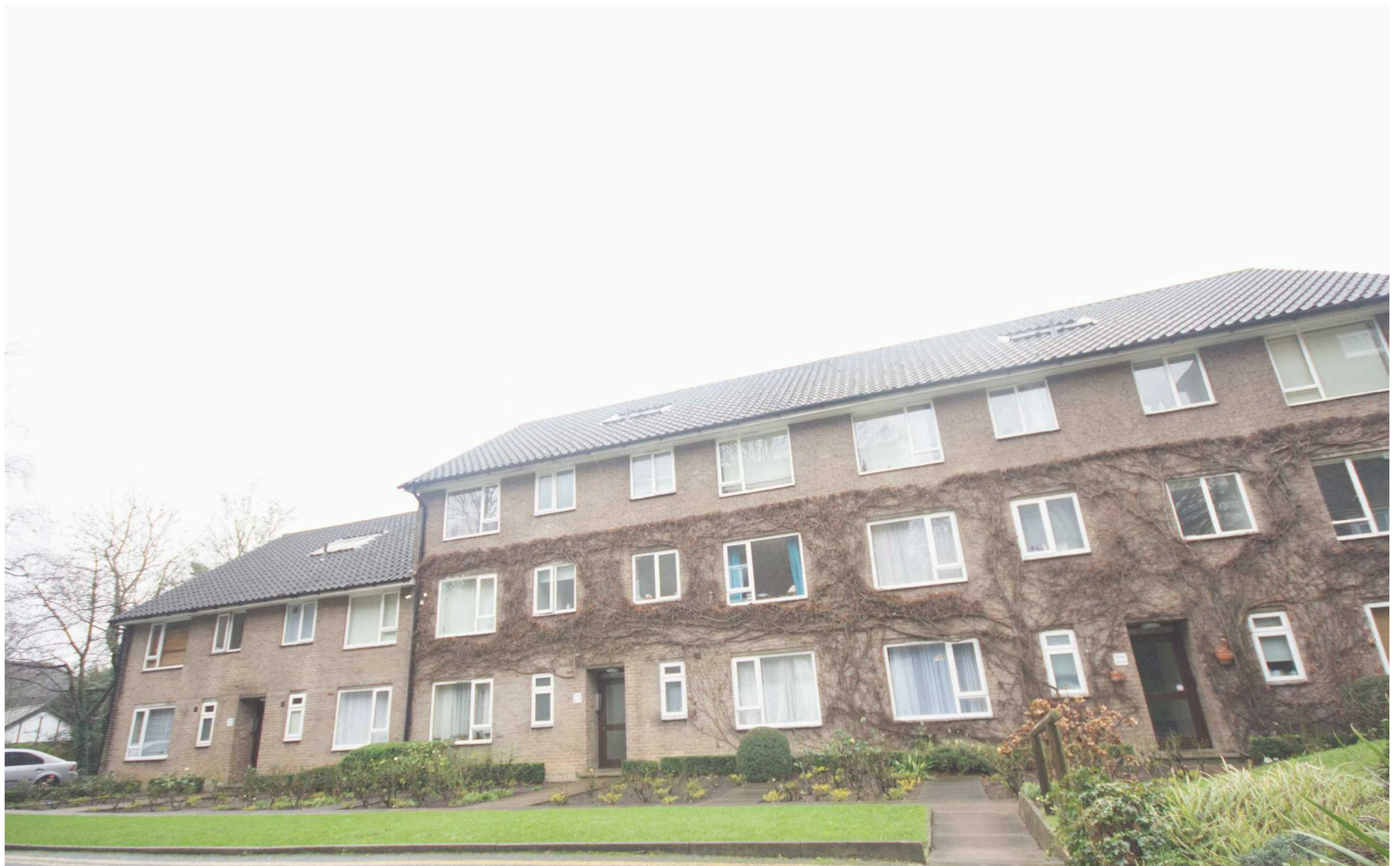
29 Moat Lodge, High Street, Harrow On The Hill, Middlesex, HA1 3LU £1,095 Per Calendar Month