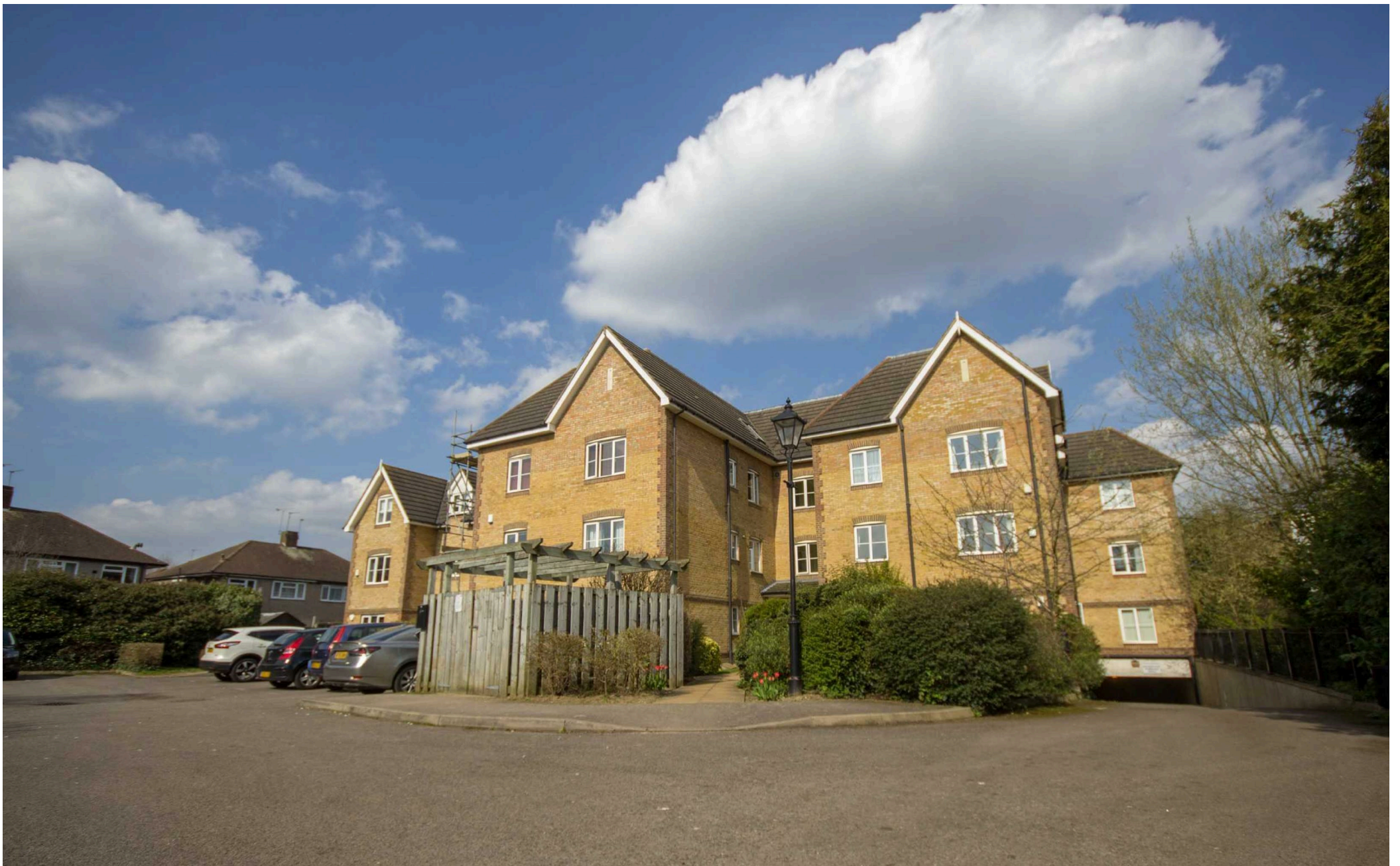
6 Leaf house Catherine Place, Harrow, HA1 2JW £1,425 Per Month