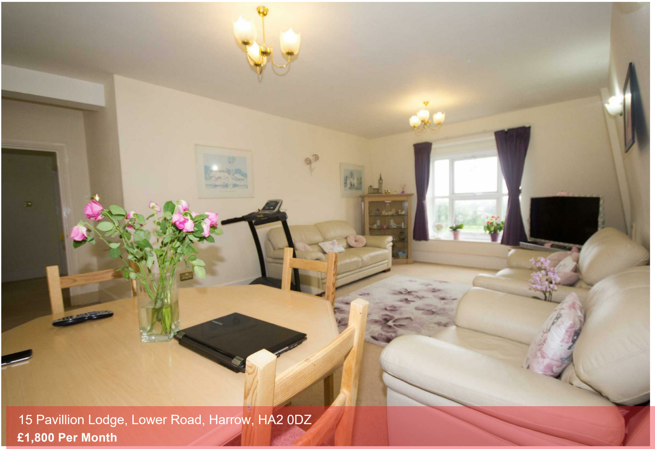
15 Pavillion Lodge, Lower Road, Harrow, HA2 0DZ £1,800 Per Month