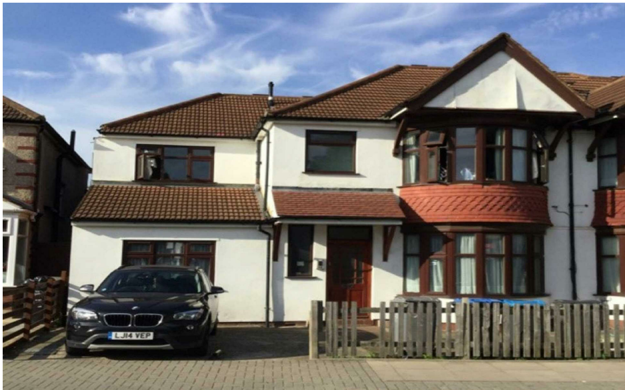
53a Northwick Avenue, Kenton, Middlesex, HA3 0AA £1,950 Per Month