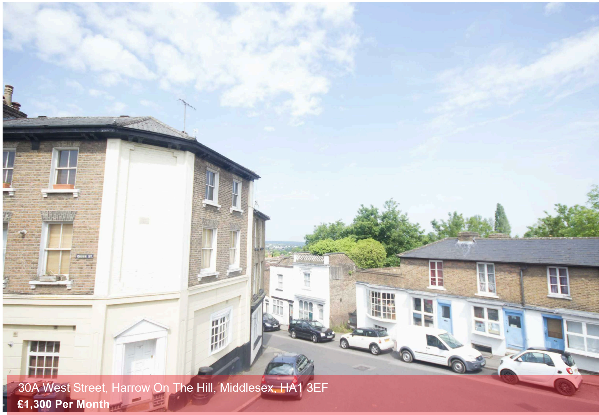
30A West Street, Harrow On The Hill, Middlesex, HA1 3EF £1,300 Per Month