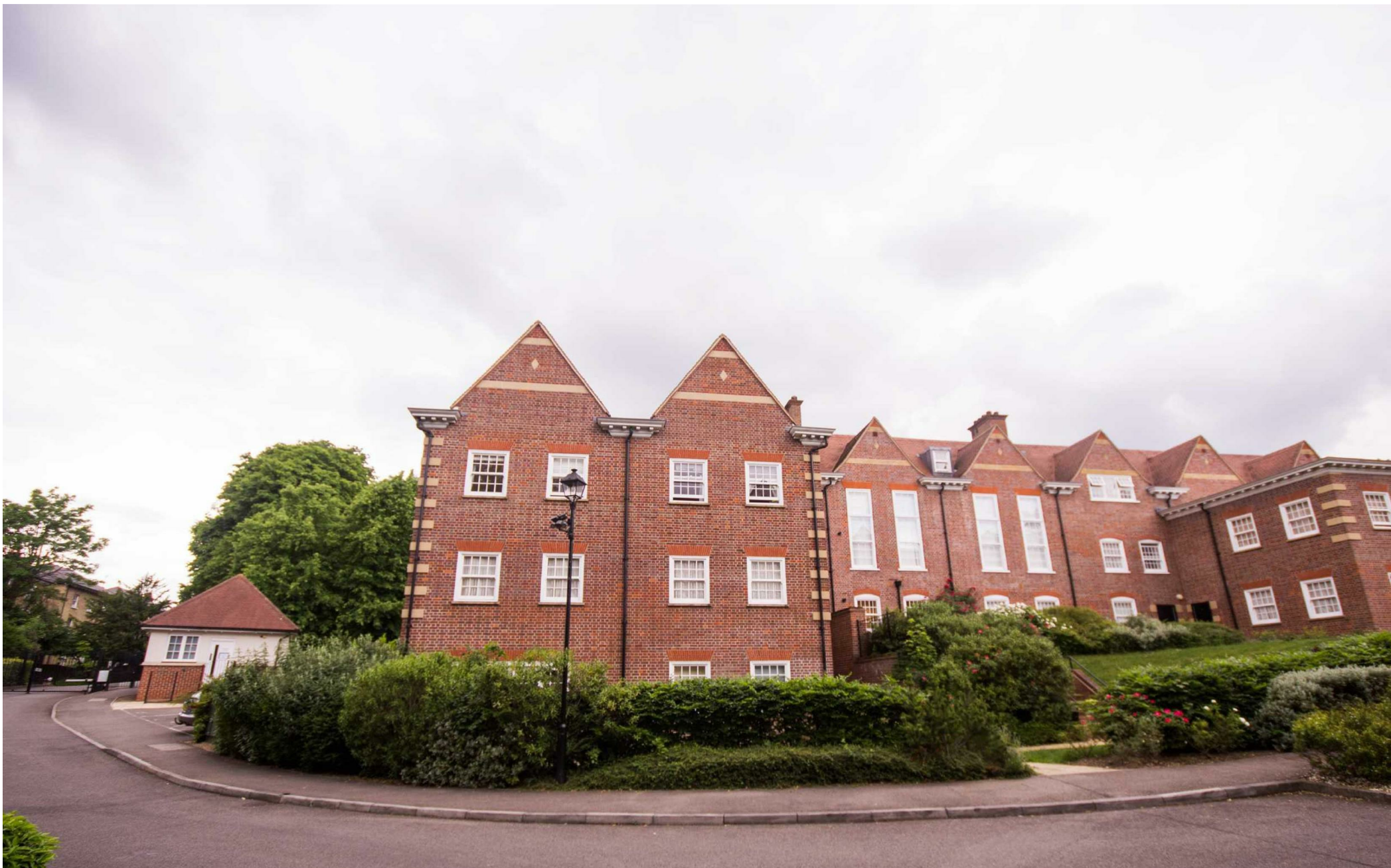
1 Langton house Cottage Close, Harrow, Middlesex, HA2 0HG £1,800 Per Month